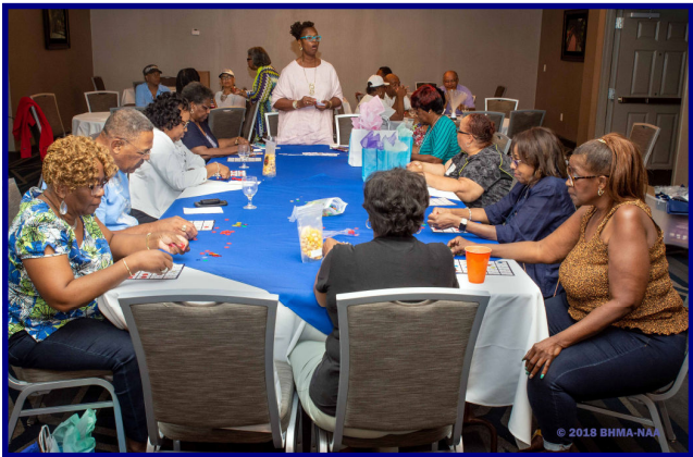
See more photos on our website at www.mathernaa.org