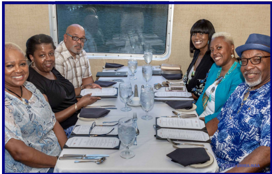
EMANUEL AME CHURCH